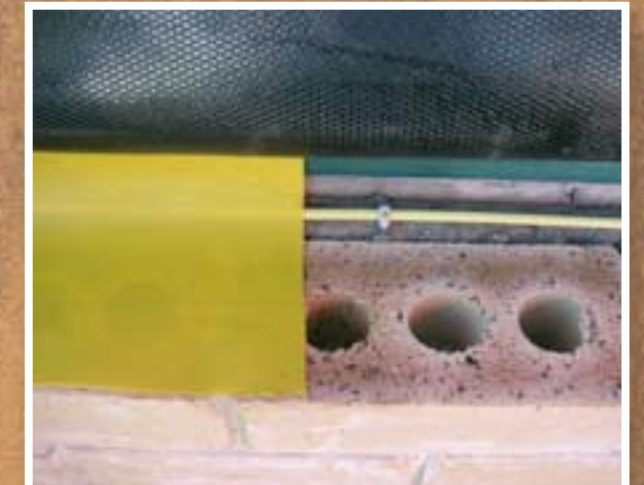
Bricked Up Base