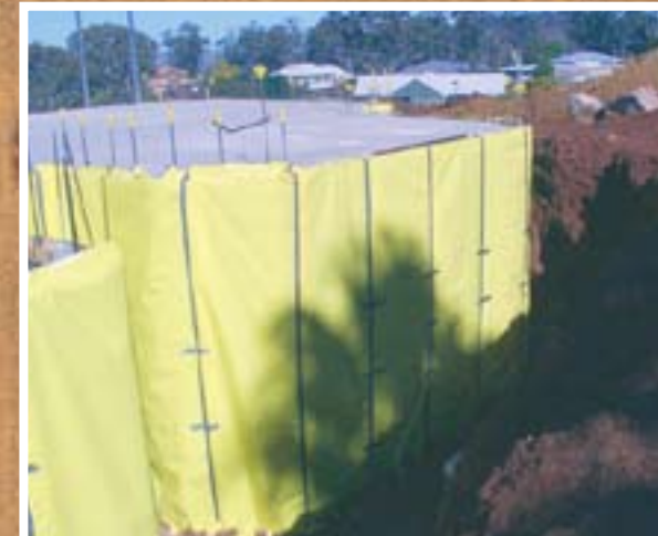
Large Retainer Wall

You can use Plasmite™ Reticulation for your new home, extension and building construction.